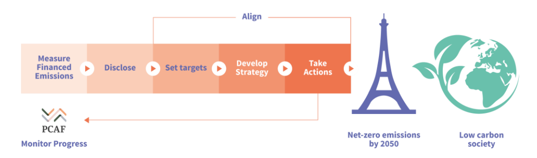
Figure 1. Visualization from CO<sub>2</sub> footprint to action

As part of her new strategy 'Road to impact' BNG Bank measures and reports not only her carbon footprint but also on her social impact, so that she can work on continuously improving this impact. For this, she uses the Sustainable Development Goals (SDGs) as her guiding principles. BNG Bank mainly targets five SDGs on which she can maximize the impact by helping her clients with sustainable cities and communities (SDG 11), good health and well-being (SDG 3), quality education (SDG 4), affordable and clean energy (SDG 7), and climate action (SDG 13).