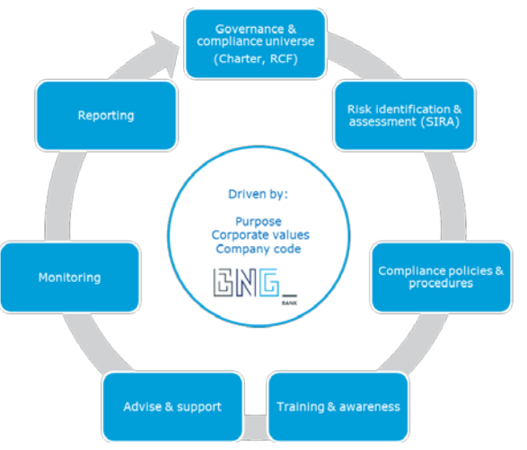
Figure 2: Compliance cycle BNG Bank

The main activities of the compliance function stem from its key tasks as defined in the Compliance cycle, further detailed in the manual of the compliance function. The Compliance cycle and manual define how the compliance function operates and secures an adequate compliance management process.